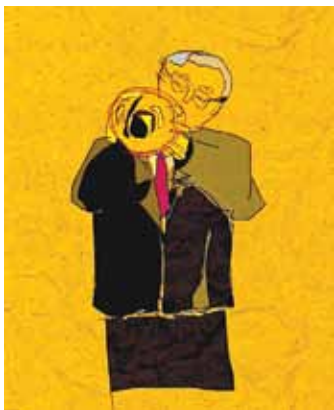
These three musician studies show some of the work Gloria has been doing using her iPad to draw!