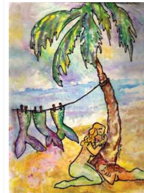
A few from Gloria's lighter side... Mermaids Take a Break and hang their tales to dry , Sheep Knitting , and Blue Cow .