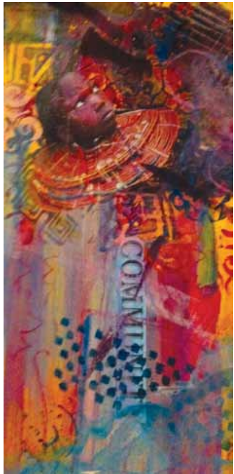
Avner's collage entitled Roots was selected to be in the 2016 Women Artists Datebook.