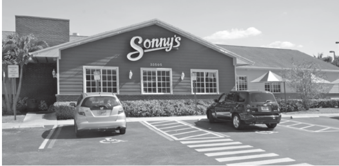
What a treat! Lunch at Sonny's Barbecue. They have the best salad bar, always fresh and full, the food is delicious and server Patsy was excellent!