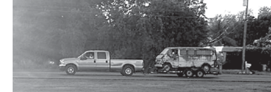
History leaving the Keys ...the old blue mini-bus... Lots of people rode in this over the years. Lots of stories there!! The roof blew off and hit a Lexus on the way out of the Keys. Damaged the car - but they are o.k. Now they have a story to tell too...