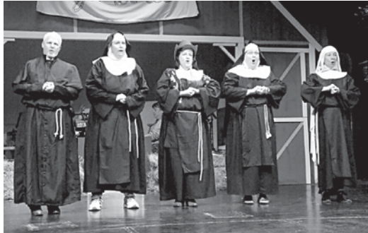
Key Players' Nunsense was great fun!