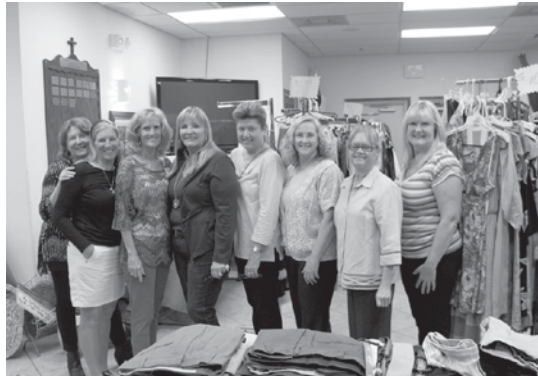
MARC staff and volunteers put on a fabulous shopping event at the Islamorada Moose.