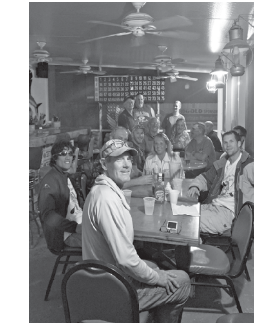
Key Largo American Legion Post 333 hosts Team River Runner wounded veterans.