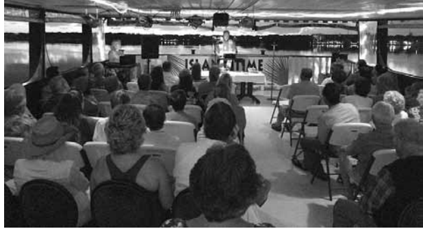
Easter Sunday Sunrise Service on Island Time Cruise.