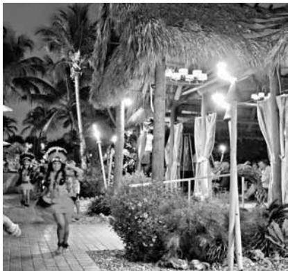
Snook's Polynesian night.