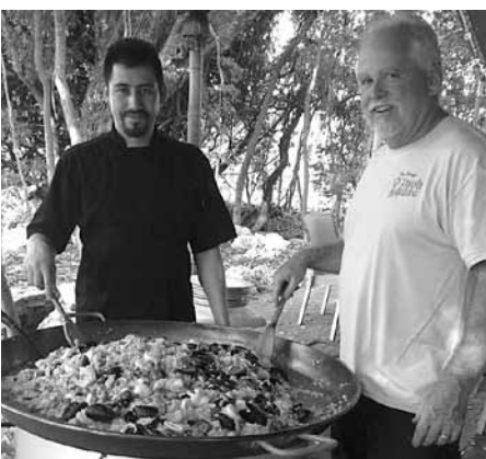
Paella... now at The Key Largo Conch House!