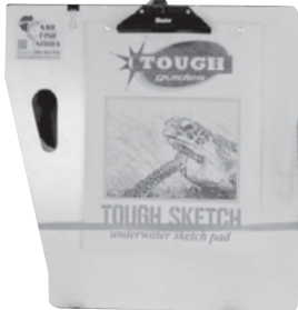
Tough sketch underwater sketchpad.