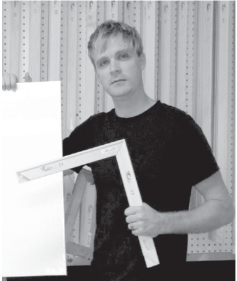
Framing – one more reason to visit The Art Box in Key Largo at MM 100.2 Oceanside.