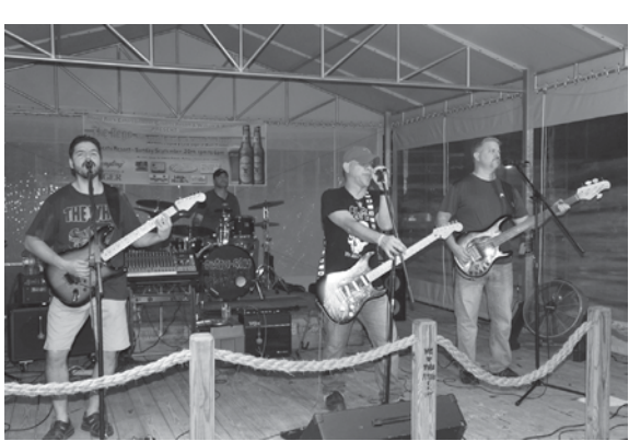
Retrosky Band at Gilbert's.