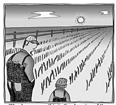
Age of Asparagus, Age of Asparaguuuus