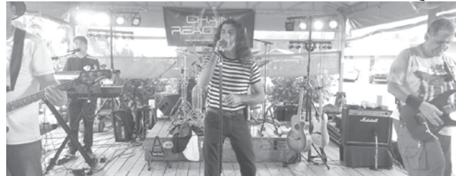
'Chain Reaction' performs Journey & Styx songs at Gilbert's. Close your eyes and it sounds like a Journey concert!