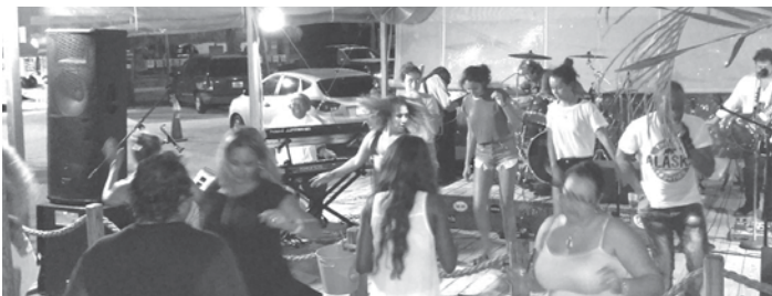
The Mojo Scoundrels have no problem getting everyone up and dancing.... Check the Gilbert's ad to find out when they are performing next.