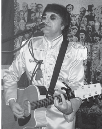
The Beatleman was spotted at Gilbert's this month.