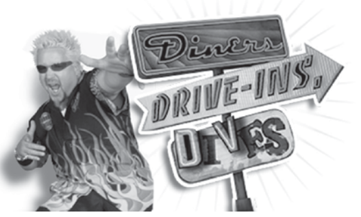
As seen on Diners, Drive-Ins and Dives on Food Network!!