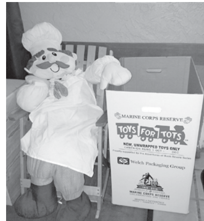
Toys for Tots drop off at Cafe Largo.