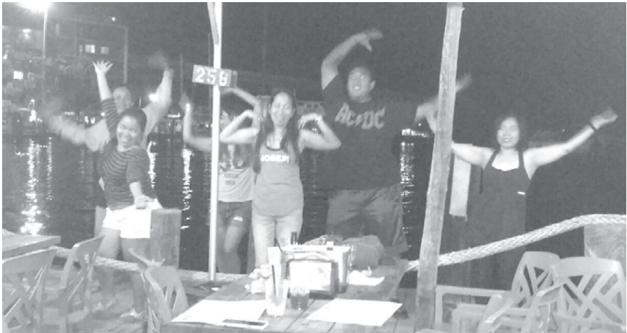
Some Gilbert's diners take a break from eating to do the YMCA with "Gypsy Lane" which feature two original members of The Village People.