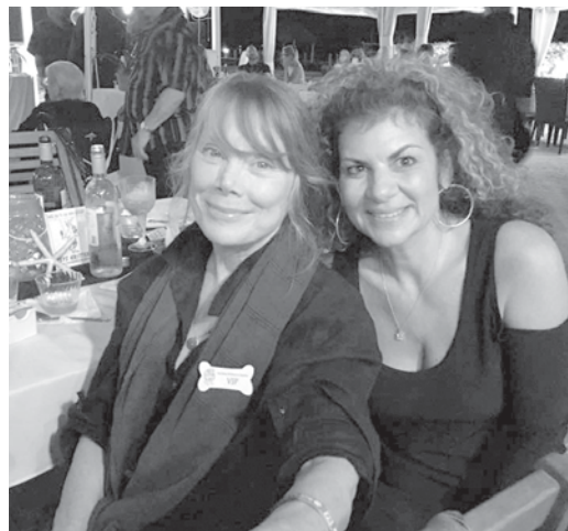
Also attending the gala: The cast of Bloodline was at Snooks. Sissy Spacek with Cheryl Holt.