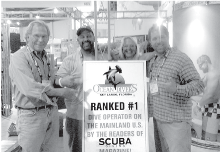
Congratulations Ocean Divers! They worked very very hard for this honor, #1 dive operation in the USA and #8 in the world as voted by the readers of Scuba Diving Magazine. This was an entire staff effort!