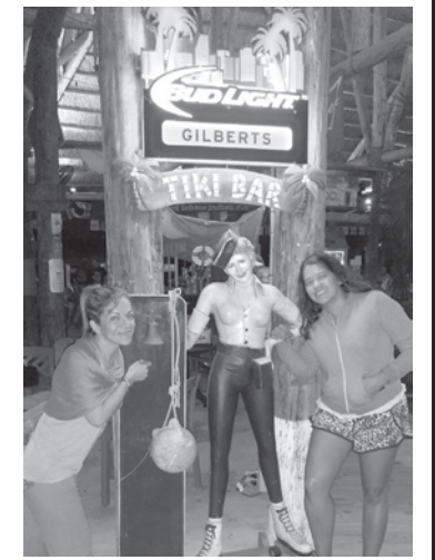
Miami locals & Gilbert's regulars