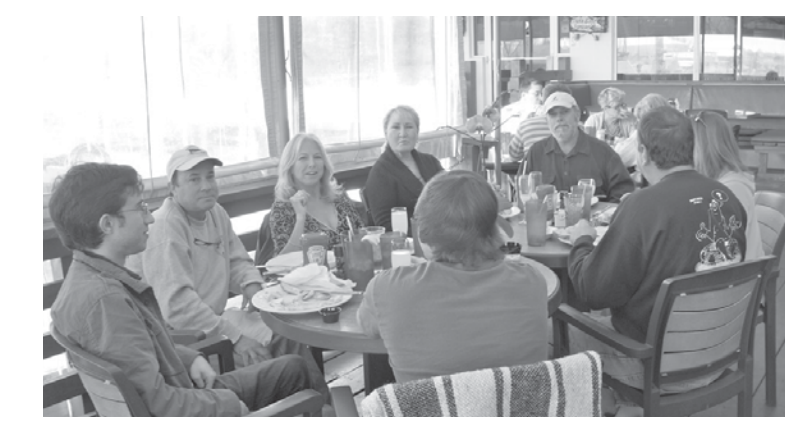
Locals keeping warm at the Pilot House.