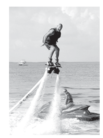
Keys Adventure Watersports has a new look for the new year. They still offer jet ski rentals, boat and jet ski snorkeling plus Ecotours, sunset cruises and boat rentals. Newly added water activities include parasailing and jet pack / jet blade flights. If you want to have fun on the water they have you covered!! Located at Jimmy Johnson's Big Chill at MM 104 Bayside, and Gilbert's Resort, MM 108.