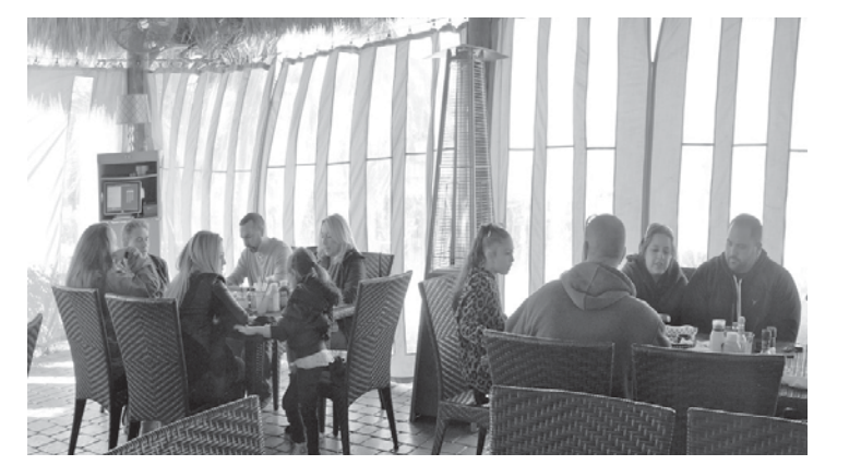
Snooks, where their warm welcome included space heaters during January!