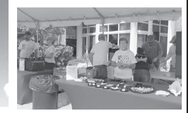
Key Largo Conch House at Pelican Cove Resort during Food & Wine Festival.