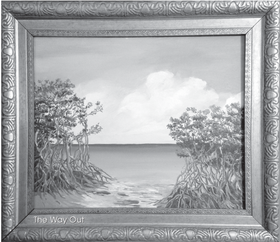
The Way Out