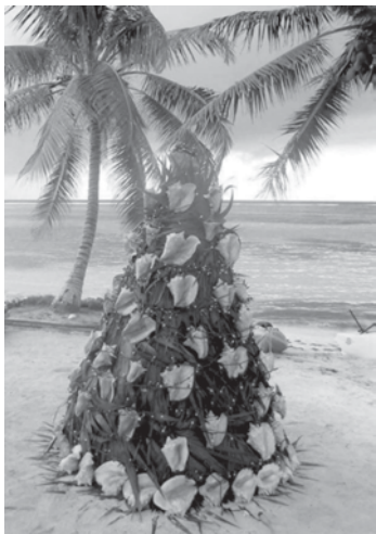
A conch shell Christmas tree. Wish we'd thought of that!