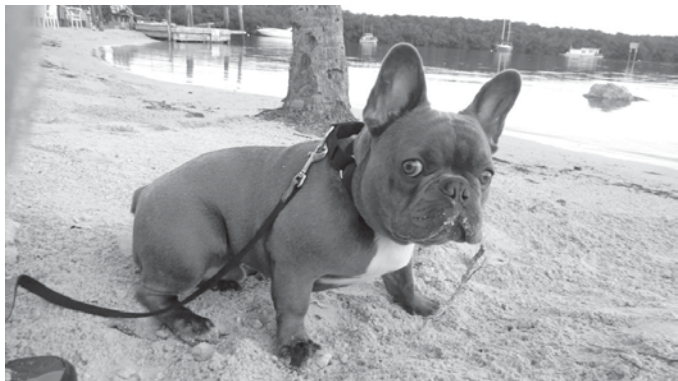
"Gilbert" the French Bulldog, mascot of Gilbert's Resort.