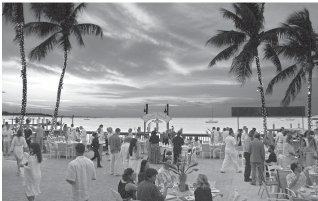
A beautiful sunset every night at Snooks Bayside, MM 99.8 in Key Largo.