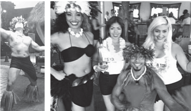
Hula fun at Snook's Polynesian Luau! The next one is February 20th - don't miss it!