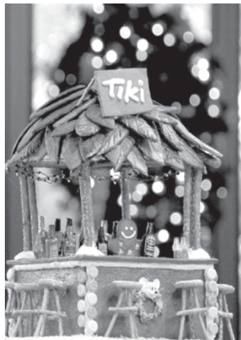
One of our local tiki bars, made from gingerbread!