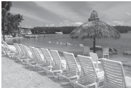
Beach chairs are lined up and waiting for you at Gilbert's Resort, MM 107 bayside.