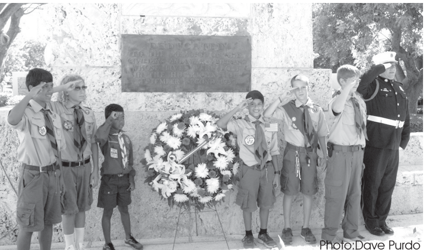
From Boys Scouts, to fire fighters to several branches of the armed forces, Memorial Day was a day to remember the sacrifices made for us.