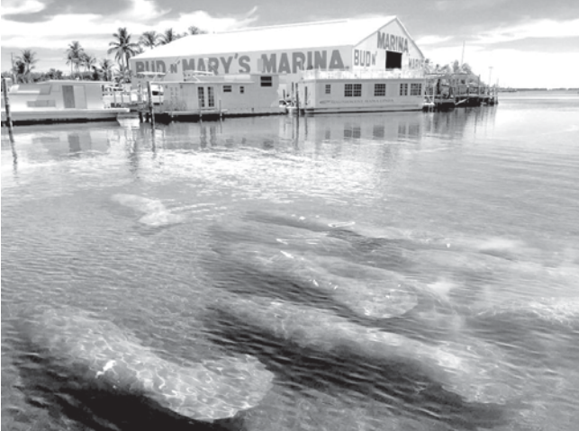
Manatees at Bud n' Mary's!