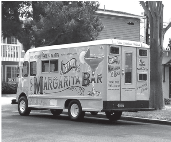
"Rasta Rita," the mobile margarita truck isn't a local, but we are hereby extending an invitation!