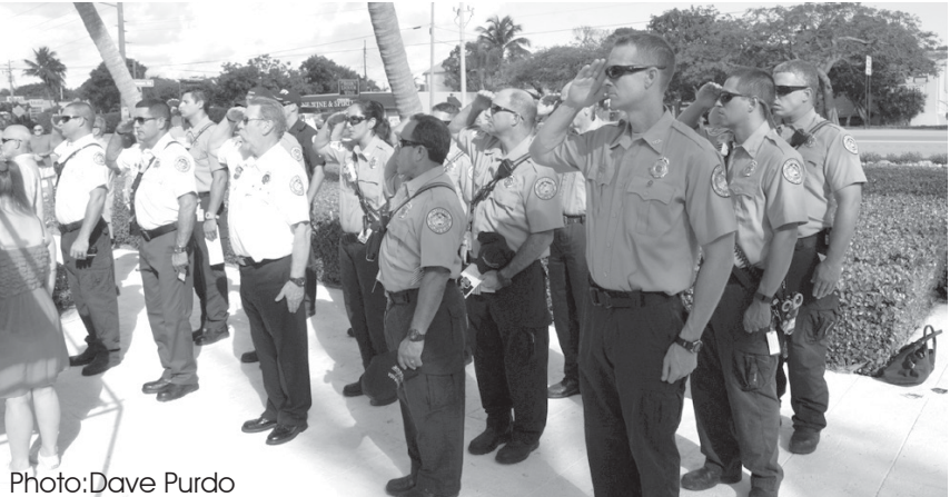
Great crowd at the Monument on Memorial Day honoring those who have fallen defending our country.