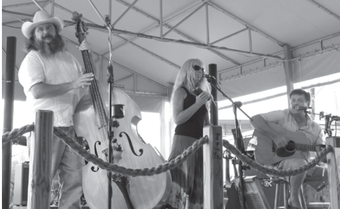
Sweetwater Band makes sweet music at Gilbert's.