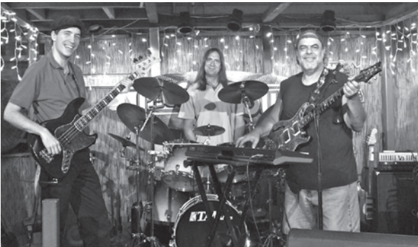
Alter Ego at Pilot House.