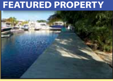
2 CANALFRONT LOTS WITH MOBILE very private with 200-ft waterfront and boat house. Lots of parking for vour boat or RV.

IN-HOUSE FINANCING • CLOSINGS IN-HOUSE ATTORNEY SERVICE... ALL IN ONE PLACE!