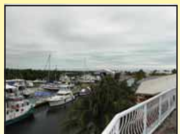
SEVERAL HOMES FOR RENTAL, ANNUAL BASIS. CALL FOR DETAILS AND SHOWINGS.