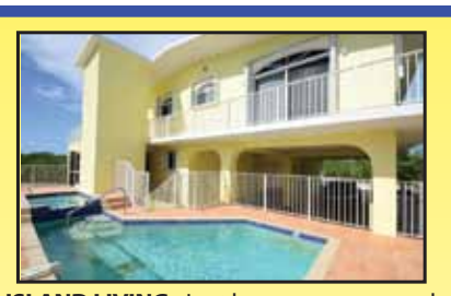
ISLAND LIVING - Last home on ocean end of canal includes a private beach area and your own hot tub which feeds into the swimming pool just above your 50' dock. Elevator and downstairs apartment. Garage, too. WOW - gotta see this one!!