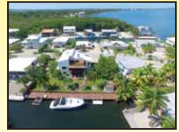
CANALFRONT HOME IN STILLWRIGHT POINT FOR SALE 4/3 lg. home on two lots, prestigious neighborhood. Contemporary style, very unique. 120 ft. dockage; some bay views.