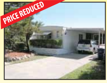
THE HARBORAGE 2/1 well maintained home with new updates. Great investment opportunity. Subdivision has a pool, clubhouse, and marina ocean front. Recently reduced to $174,500.