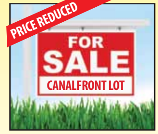
CANALFRONT LOT Popular Key Largo ocean side neighborhood. Nice location for your Keys home! Recently reduced to $114,500.