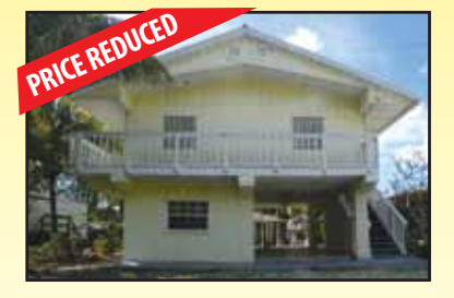
BAYSIDE CANALFRONT HOME $499.000 Very nice canal leads directly out to bay. Watch the manatees swim at your dock! Private street & location. Perfect for a family for weekends or full-time. Downstairs has plenty of storage.