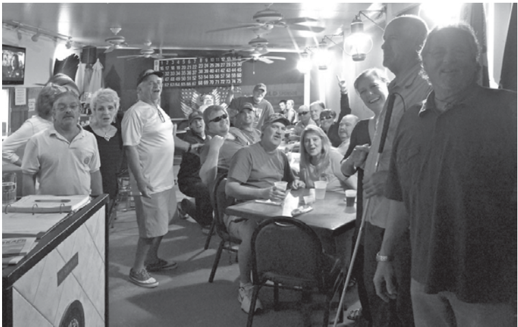
Blind Wounded Warriors visited the American Legion in Key Largo in February.