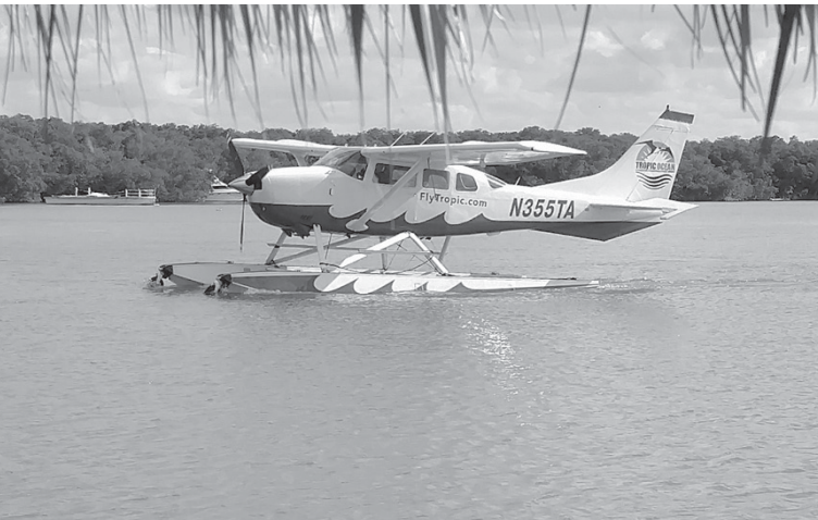
A seaplane prepares to tie up at Gilbert's dock. You never know what you will see at Gilbert's