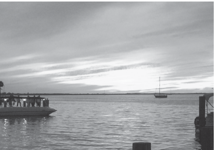
Beautiful sunset at the Big Chill.