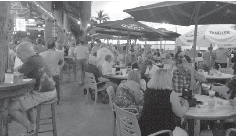
Busy night at the Big Chill.