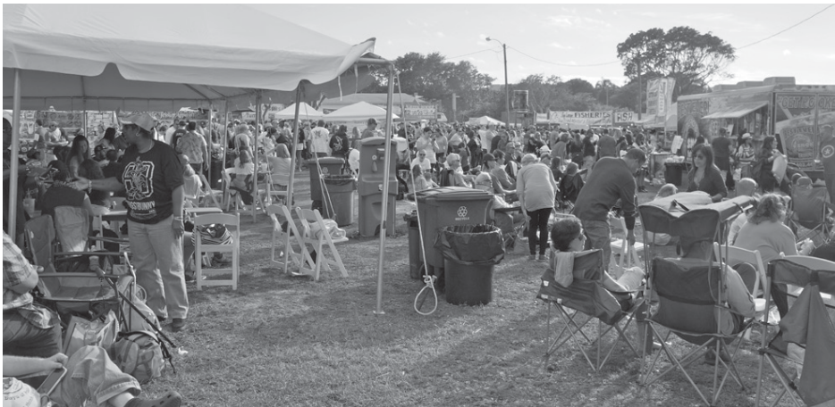
The Seafood Festival was a huge success, bringing over 10,000 people to the Keys.