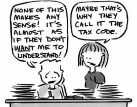
Go to a professional, try H&R Block. You'll sleep better!

Boat owners - a friend of mine gave a canvas shop in Key Largo a check for $1,000 to make him a boat cover 2 years ago and has still not received