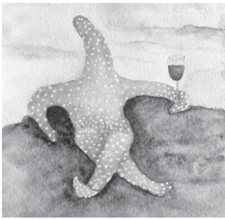
Some of Brooke's students displaying their work