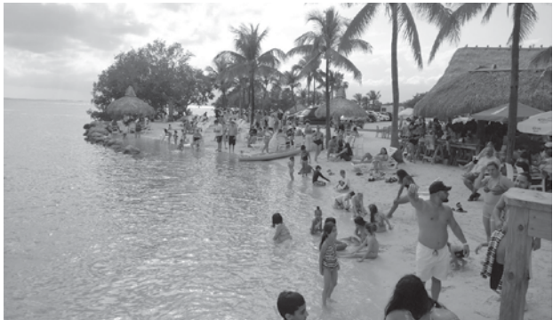
The first beach in the Keys... at Gilbert's Resort.