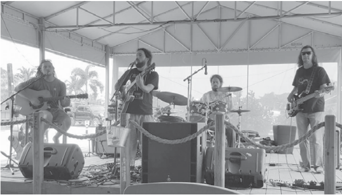
The Stone Crabs at Gilberts.