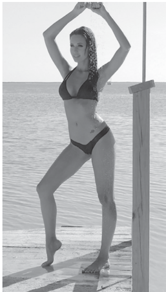
The Hooters Girls stopped by Gilbert's to take some photos. They are in the process of creating their 2017 Calendar.