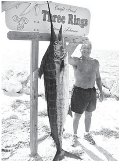
Nice job, Coach! See you at the Big Chill!!