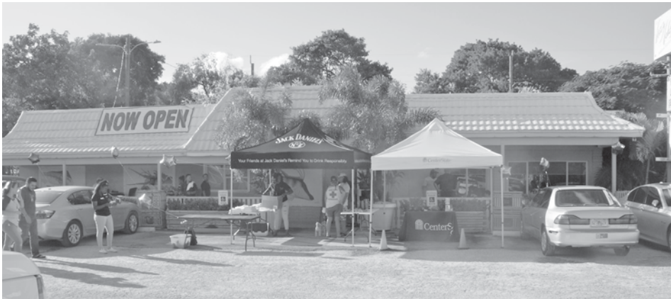
The long-awaited Key Largo eatery finally opened this month! Stop by and check it out!