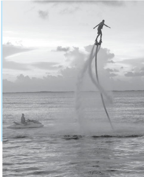
Stop by the Big Chill for all kinds of fun.