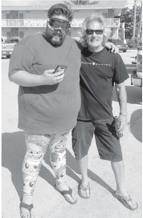
Pokemon hunters at Gilbert's Resort. Notice the ski goggles for better hunting vision!