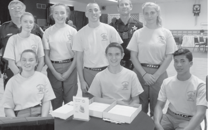
The Florida Keys Elks Lodge 1872 held a drug awareness event in cooperation with the Mason's Child Identity Program, on September 17.

Forty seven children went home with a free DVD of personal information with their height, weight, picture, DNA swab, fingerprints and more.