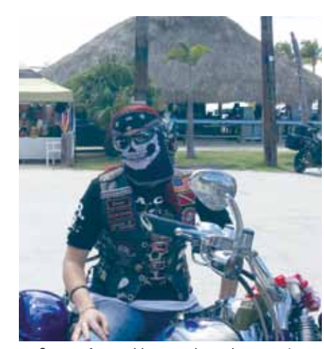
Sway from Homestead, wearing her great face protector at Gilberts in March.