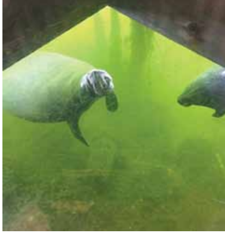
Curious manatees visit the Pilot House Glassbottom™ Bar.