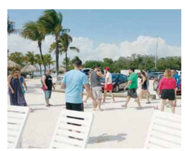
The Bank of Boston employees enjoy a team-building day at Gilbert's Resort.