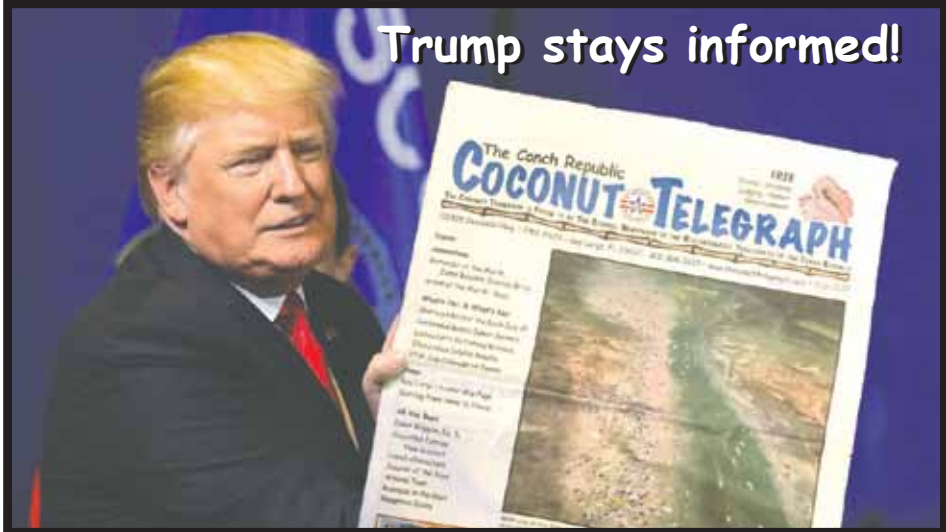
Trump stays informed!