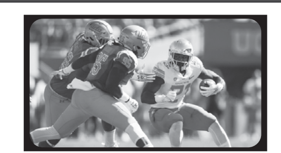
COLLEGE FOOTBALL WE HAVE ALL THE GAMES!