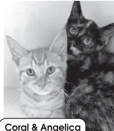
Coral & Angelica