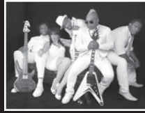
Saturday, Feb 11 GYPSY LANE BAND 7-11 PM