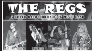
Sunday, Feb 26 THE REGS 1-6 PM