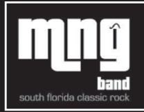
Sunday, Feb 19 MR. NICE GUY 1-6 PM