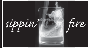
Saturday, Feb 18 SIPPIN' FIRE 7-11 PM