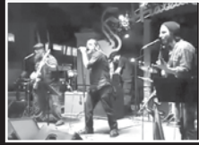
Sunday, Feb 12 APACHE DRAGON 1-6 PM