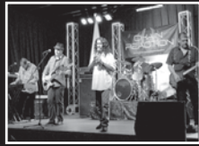
Saturday, Feb 25 CHAIN REACTION Journey Tribute Band 7-11PM