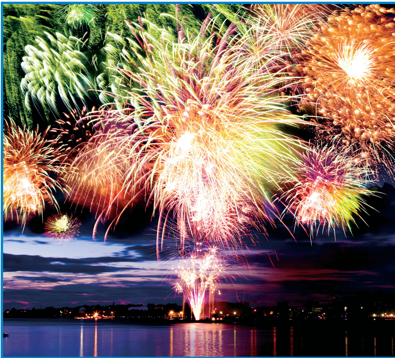
Spectacular fireworks herald the new year! Watch them in Key Largo at MM 104 on Blackwater Sound, courtesy of the Key Largo Merchants Association.