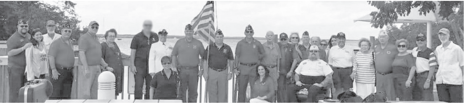
Pearl Harbor Day Ceremony at Murray Nelson Park - VFW Post 10211 ceremony. Also participating: VFW Post 10212, American Legion Post 346, Amvets, American Legion Post 145 and many more.