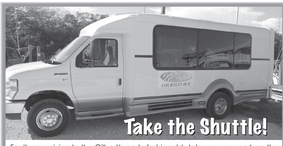
For those arriving to the Gilbert's party fashionably late, you can park on the main access road and take the FREE air-conditioned shuttle to and from Gilbert's on Saturdays and Sundays from noon-8pm.

The hiring of a lawyer is an important decision that should not be based solely upon advertisements. Before yo decide to hire an attorney, ask us to send you free written information about our qualifications and experience