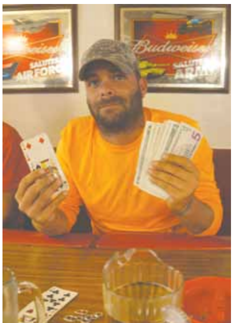
We have a winner!

Show Me The Money is played at the Key Largo VFW on Monday, Tuesday and Wednesday at 6 pm. The American Legion plays Fridays at 7 pm and the Key Largo Moose plays Show Me The Moose Bucks on Sundays and Tuesdays at 7 pm, and they play 20 games. Word of warning: if you get excited and yell out Show Me The Money instead of Show Me The Moose Bucks you will be encouraged to partake in a chicken dance. Guaranteed fun!