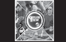
Saturday, June 24 CUTLER STEW 1-5 PM