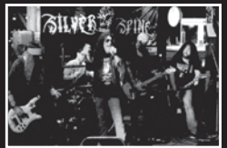
Saturday, June 17 SILVER SPINE 1-5 PM