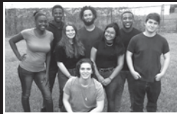
Saturday, June 10 BAY JAMMERS 1-5 PM