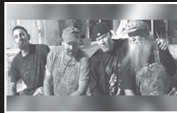
Saturday, June 3 UNCLE SMOKEY 1-5 PM