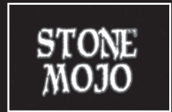
Saturday, June 17 STONE MOJO 7-11 PM