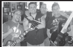
Saturday, June 10 STATIC 7-11 PM