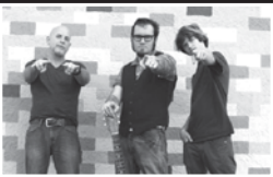
Saturday, June 3 THE FLYERS 7-11 PM