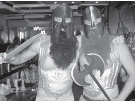
Just another Ladies Night at the Big Chill.