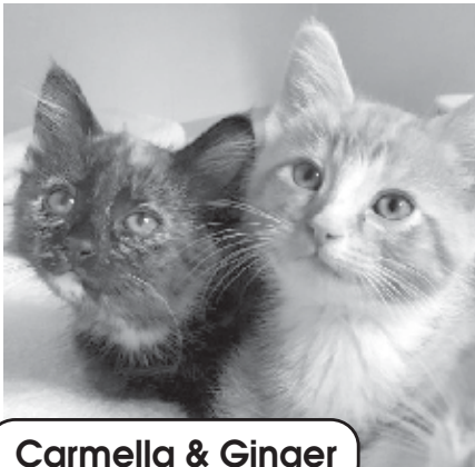
Carmella & Ginger