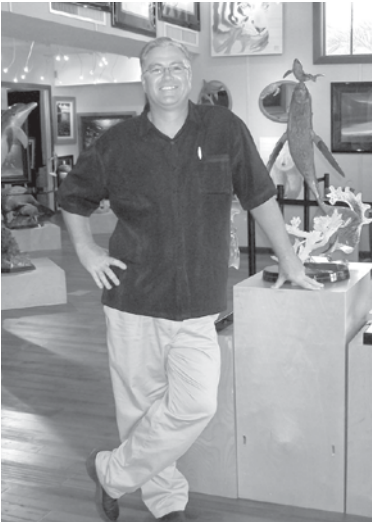
Remembering Chuck Buckles.