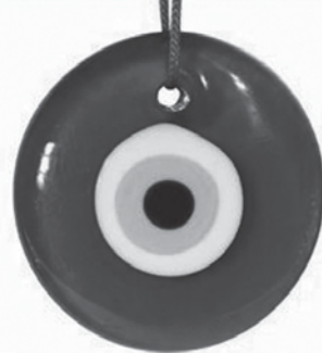
This pendant is a bright blue talisman. Look for talismans like this at local flea markets.

If you go to any flea market you will most likely find several vendors that carry talismans to ward off the evil eye. Disc's or balls, consisting of blue and white circles with an eye in the center are called repellent talismans or apotropaic (Greek for "protective") charms that are believed to have the power to bend the malicious eye back toward