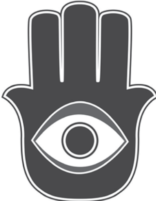
The Hamsa, a charm made to ward off the evil eye.

For when they are persistent I keep a collection of business cards from people that I don't like, specifically for this type of situation. Pull one out, hand it to him, wink and say in a throaty sultry voice "call me later" as you quickly walk out the door and head to the nearest flea market.