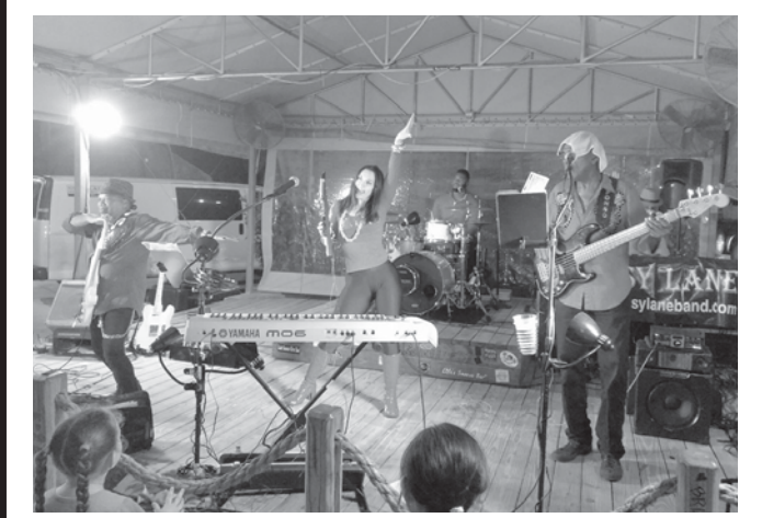
Gypsy Lane rocks the crowd at Gilbert's Resort