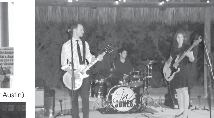
JW Jones Band at Bayside Grille.