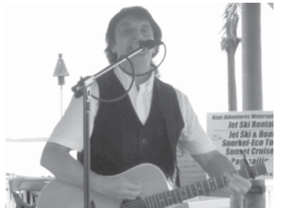
Beatleman at the Big Chill.