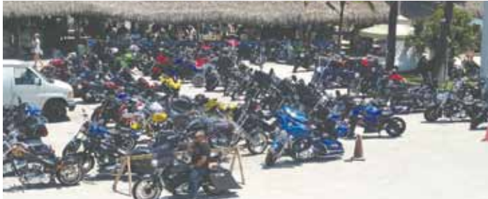
There's never a shortage of amazing motorcycles on a Sunday at Gilbert's Resort.