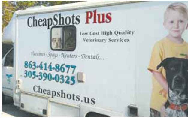
Call for an appointment - they park at Tradewinds Plaza.

Voted Best Happy Hour in the Keys! 4-7 Daily