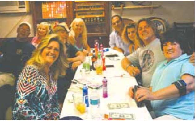
Bingo at the VFW is always fun!