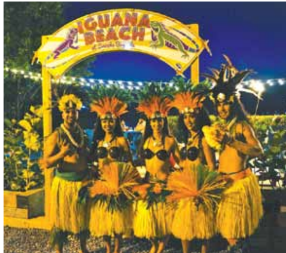
The Luau at Snook's is always a crowd pleaser!