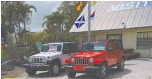
Rent a Jeep at the Keys Visitor Center!