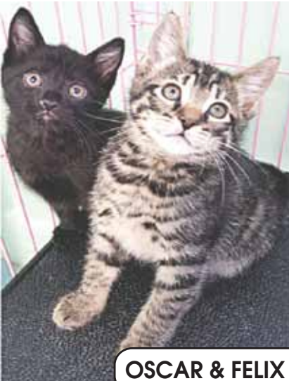
OSCAR & FELIX