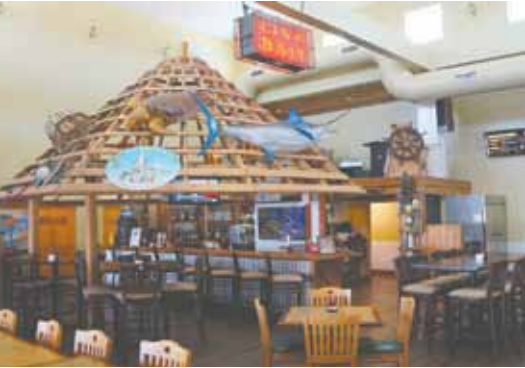
The Pilot House is available for your special event.