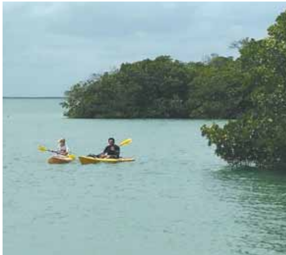
Volunteers from "MamaOcean" kayak the Gilbert's shoreline on Earth Day, looking for trash to remove.