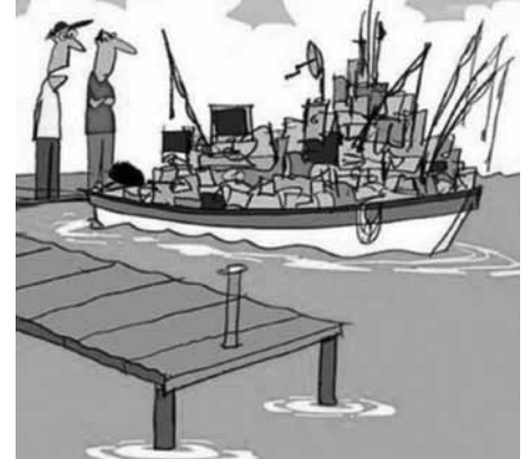
"That settles it. We either get a bigger boat. or cut back on the fishing equipment.

How many boxes of these Thin Mints do I have to eat before I start seeing results?