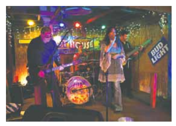
Taylor King Band at the Pilot House.