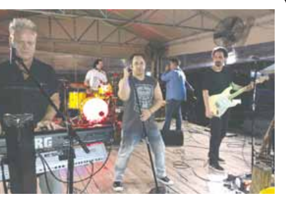
Stall 4 from Delray rocked the house at Gilbert's See them again in July.