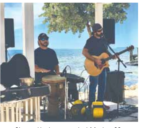
Stereo Underground at Marker 88.