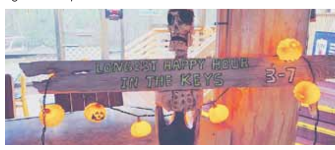
Blackwater Siren has the longest Happy Hour in the Keys (3-7pm).