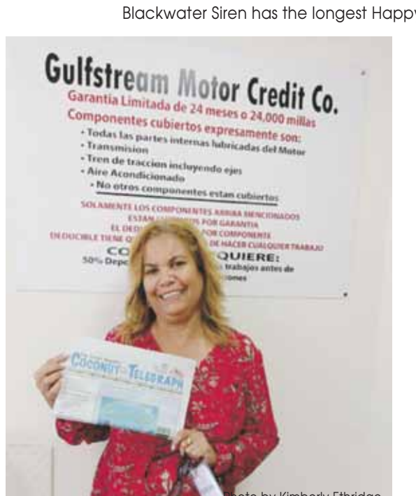
is also a reader of the CT