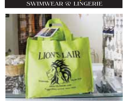
Lion's Lair is distributing care packages sorted by size and gender containing 5 outfits to Keys kids via Florida Keys schools.