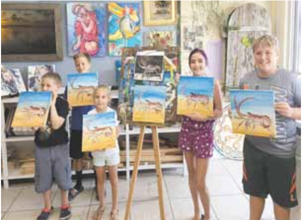
Best art classes in the Keys at the Art Box