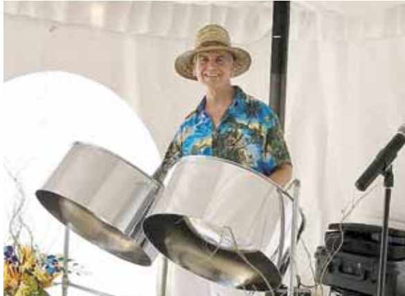
Key Largo Light House Weddings steel drum music.