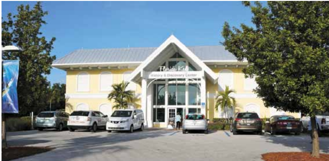
Florida Keys History and Discovery Center at the Islander - beat the heat and have fun!