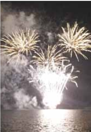
Awesome fireworks at the Full Moon Party in Islamorada.