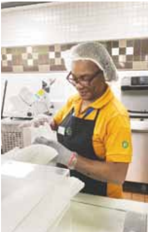
Publix makes the absolute best subs!