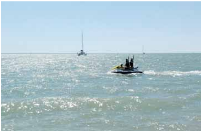
Two ladies from Italy enjoy the water at Gilbert's Resort.