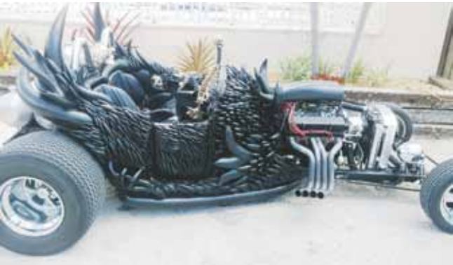
This unique car was spotted at Gilber'ts, always a great place to see interesting vehicles.