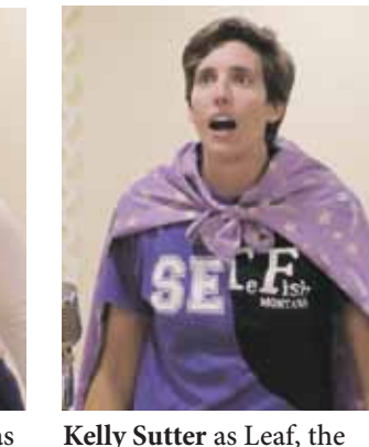
hippy child with severe Attention Deficit Disorder.