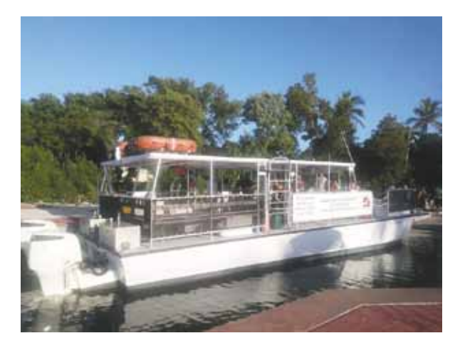
Pirates Cove Watersports is at the Mariott Bay Beach Resort. See their ad on page 4.