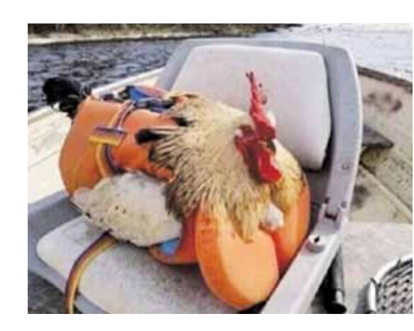
When boating with your pets - safety first!