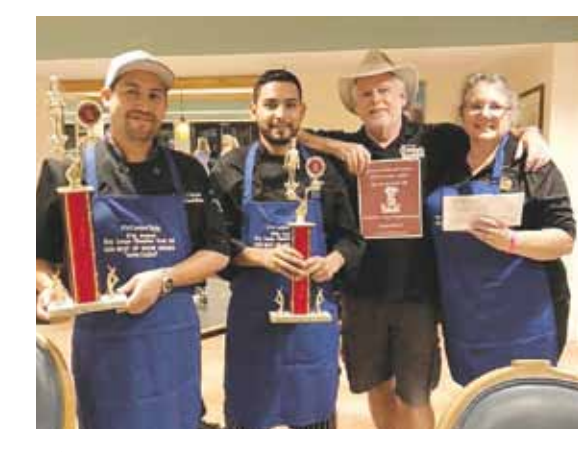
Congratulations! Key Largo Conch House won 3 awards: 2 Best of Show and the Grand Prize at the 37th Annual Key Largo Cook-off.