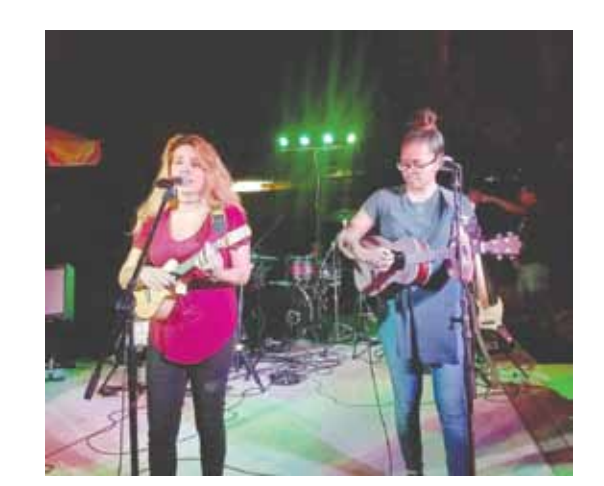
The Little Things performed at Jam Night at the American Legion.