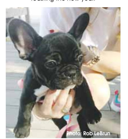
Well behaved and leashed furry friends are welcomed at Gilbert's Tiki Bar.