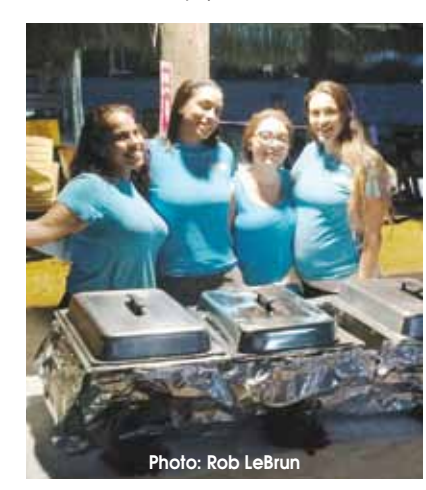
Some of the Gilberts party staff wait to serve a private party on the beach.