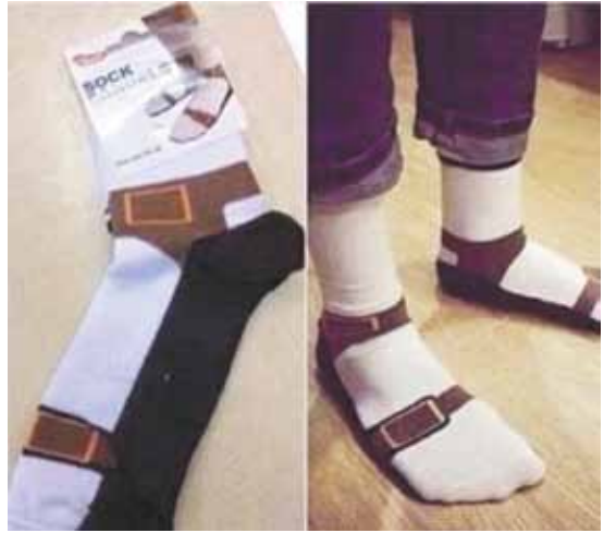
So easy to get that easygoing tourist look!