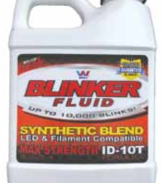
Perfect for the blonde on your list!