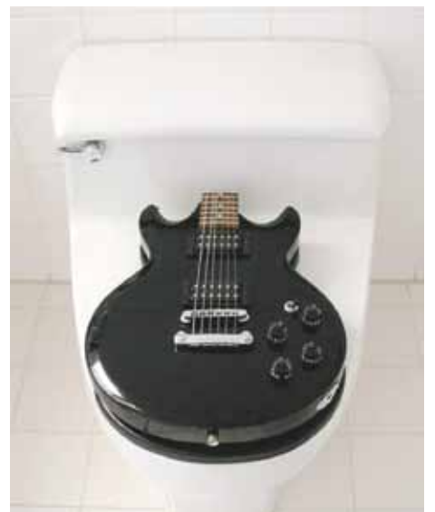
For that musician in your life.