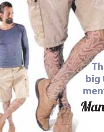
The next big thing in men's wear. Mantyhose