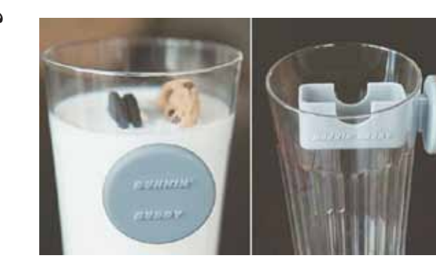
Magnetic Cookie Dunker!