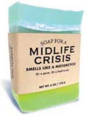
Make sure you pick the right soap.