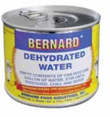
Be ready for the next hurricane with plenty of this Dehyrated Water!