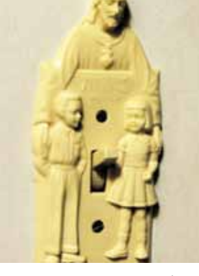
It's just wrong!