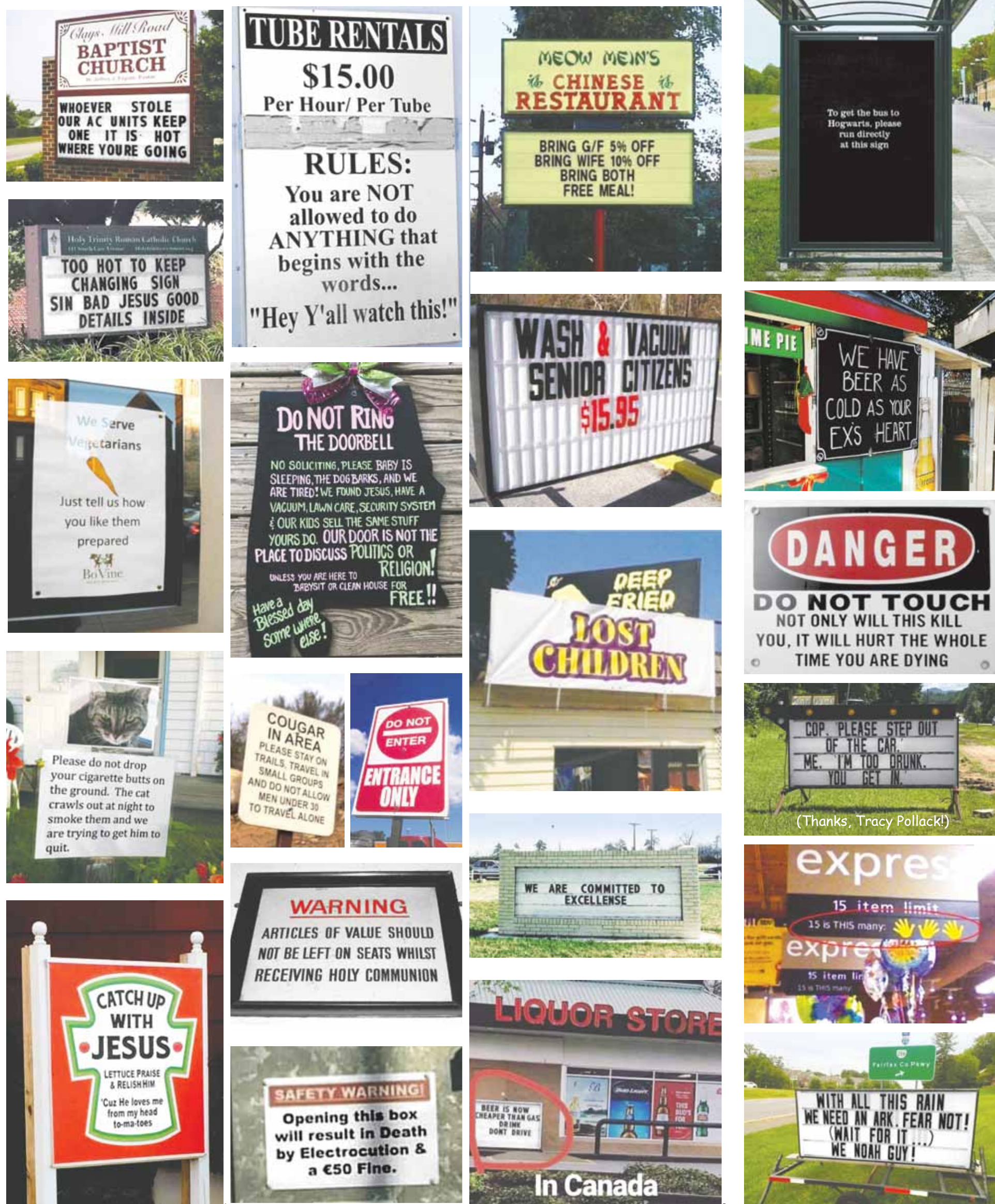
Signs of the Times We suspect some of these are not for real, but which ones?