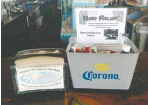
Gilbert's Resort is proud to be partnering with Reef Relief. Skip the straw and help protect our coral reef ecosystem.