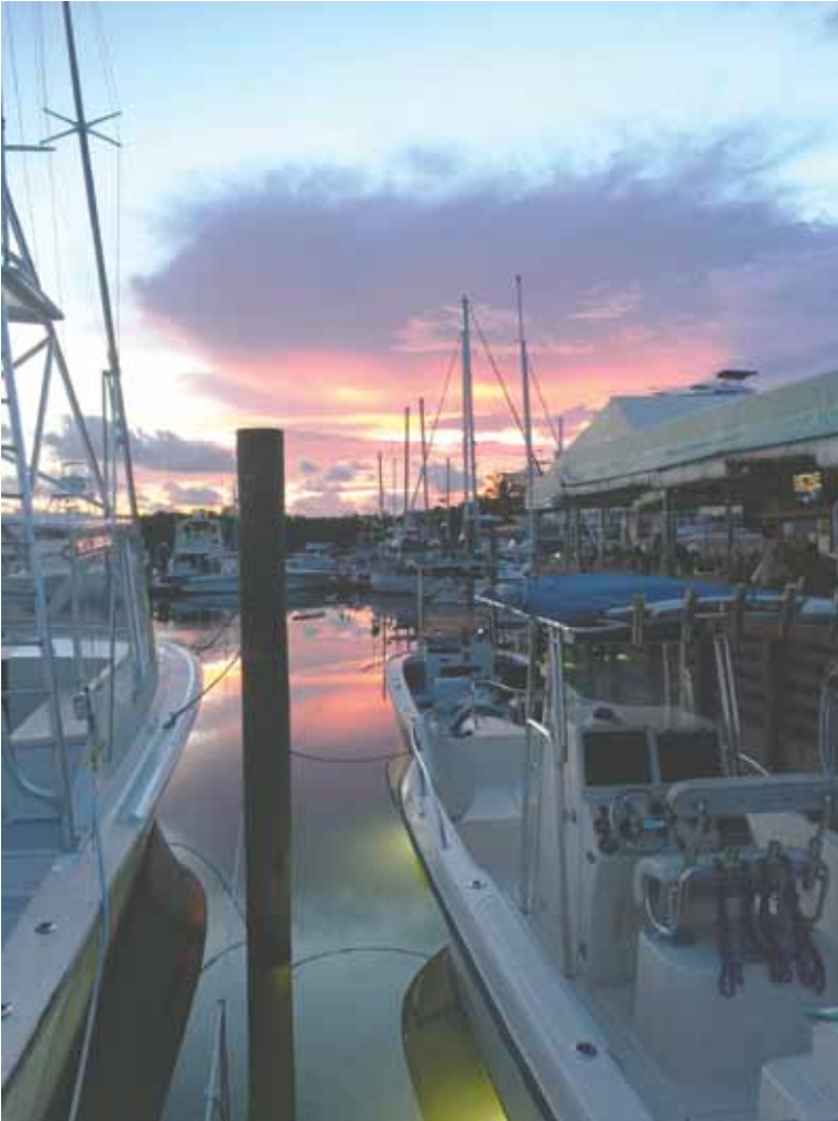
Good Night! Beautiful Pilot House sunset!