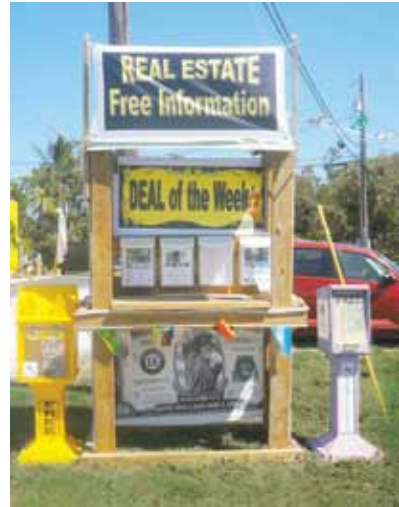
You can pick up the Coconut Telegraph at Tropical Realty MM 103