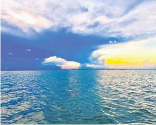
Sunset from Big Chill.