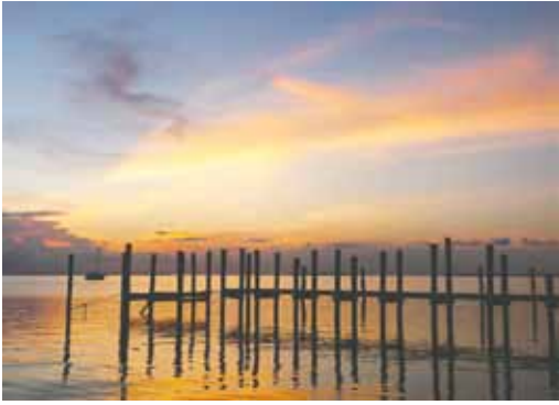
Another great sunset.