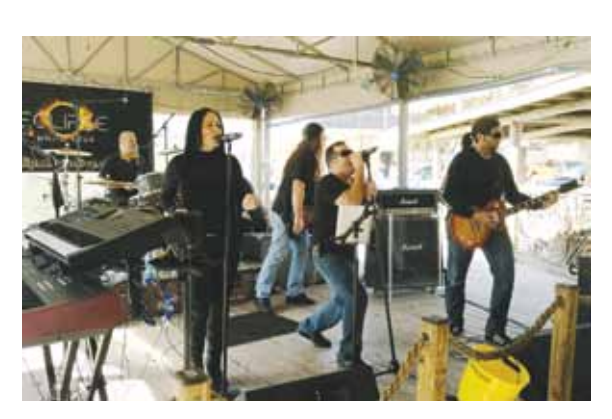
Eclipse rocked the stage at Gilbert's in December. See them again on March 11th.