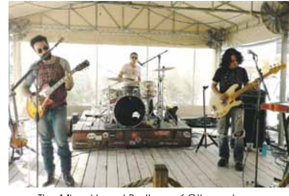
The Miami band Brothers of Others always bring a great show to Gilbert's.