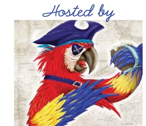
Pirates on the Water "Party with a Purpose"