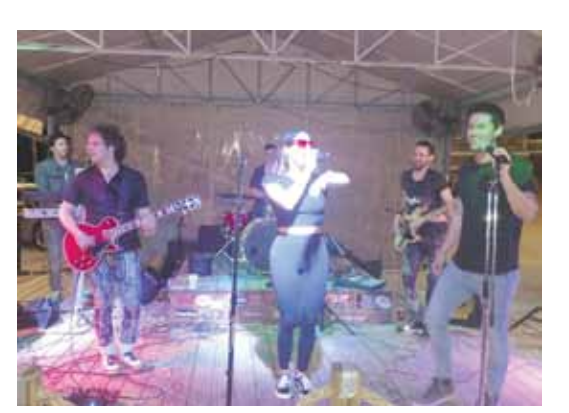
The Tight Band from Miami made their Gilbert's debut last month and rocked the place!