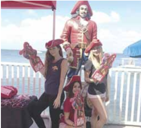
Captain Morgan party at Big Chill.

Boca Raton • Key Largo • Online 561- 221-5575 99353 Overseas Hwy #16 Key Largo, Florida 33037 www.dawnwigginstherapy.com