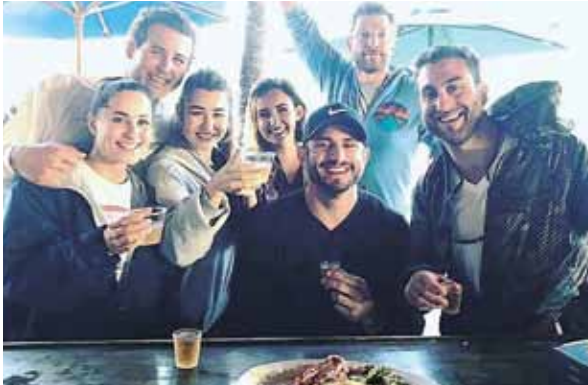
Baseball Superstar Anthony Rizzo, MVP of the Chicago Cubs in the 2016 World Series, attended high school at Marjory Stoneman Douglas High School in Parkland, Florida. Recently he stopped by Gilberts when he was in south Florida to speak to students following the shootings.