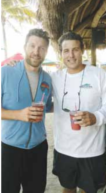
Country Superstar Brett Eldredge and Chicago Cubs MVP Anthony Rizzo enjoy a Boobie drink at Gilbert's Resort.