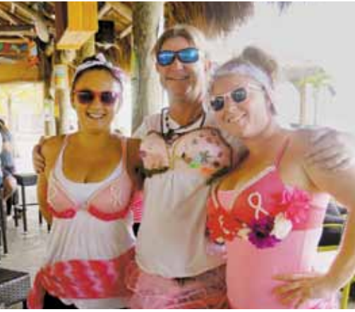
3 beauties from the Ralphie walk at the Big Chill.