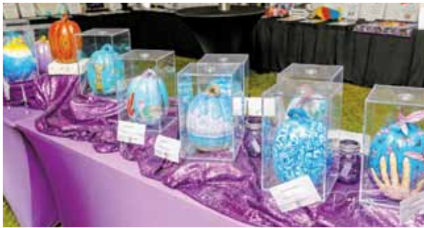
Local artists decorated amazing pumpkins, sold at auction.